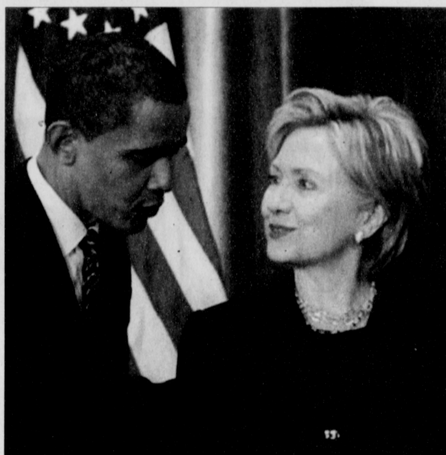
President-elect Barack Obama speaks with U.S. Sen. Hillary Clinton after announcing that she will be his choice for U.S. Secretary of State during a Monday news conference in Chicago.

There is no evidence that brand-name drugs given to treat heart and other cardiovascular conditions work any better than their cheaper generic counterparts, U.S. researchers said on Tuesday.