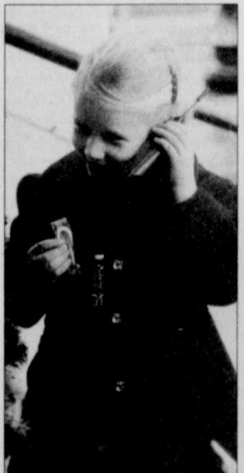
Kids can make phone calls to Santa during this weekend' Christmas Tree Lighting and Fireworks Celebration in Gresham.

A candlelight parade will be lead by Santa himself, from the Main Stage to a tree lighting and holiday fireworks display at the Center for the Arts Plaza.