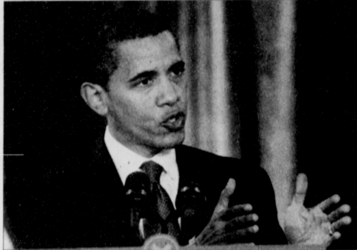
President-elect Barack Obama gestures as he answers questions during his news conference introducing members of his economic team.

He blended criticism of Detroit's beleaguered Big Three automakers — General Motors Corp., Ford Motor Co. and Chrysler LLC — with a pledge of support for government aid to