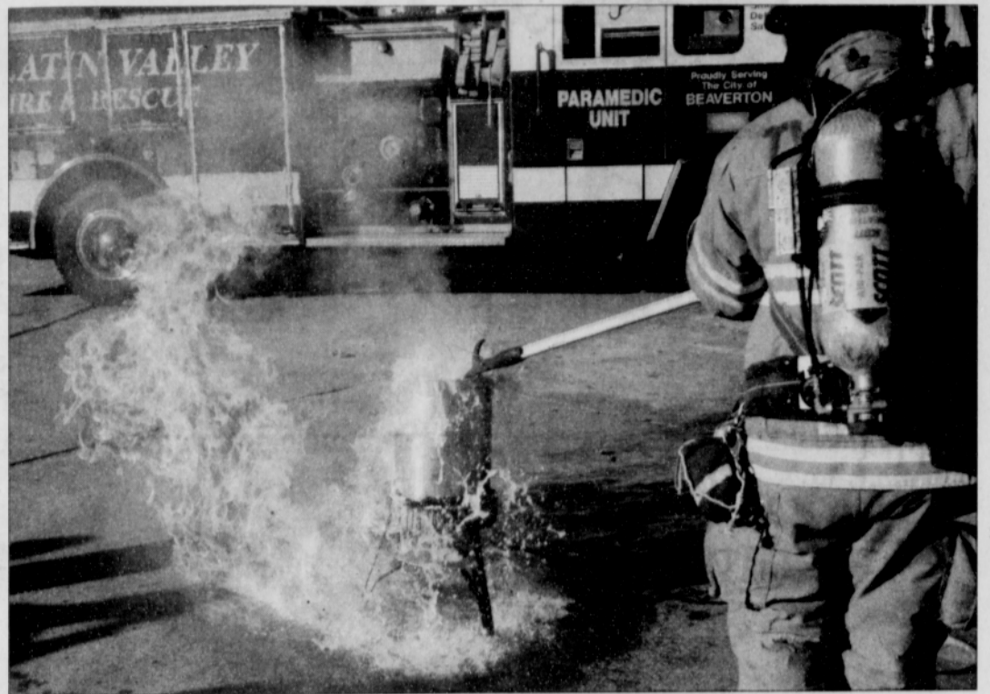
Oil splashing over the sides of an overfilled turkey fryer is ignited by the open flame beneath the fryer.

Also, never pour water on a grease fire. The flames will "splash," resulting in burns to your body and can spread to cabinets and countertops.