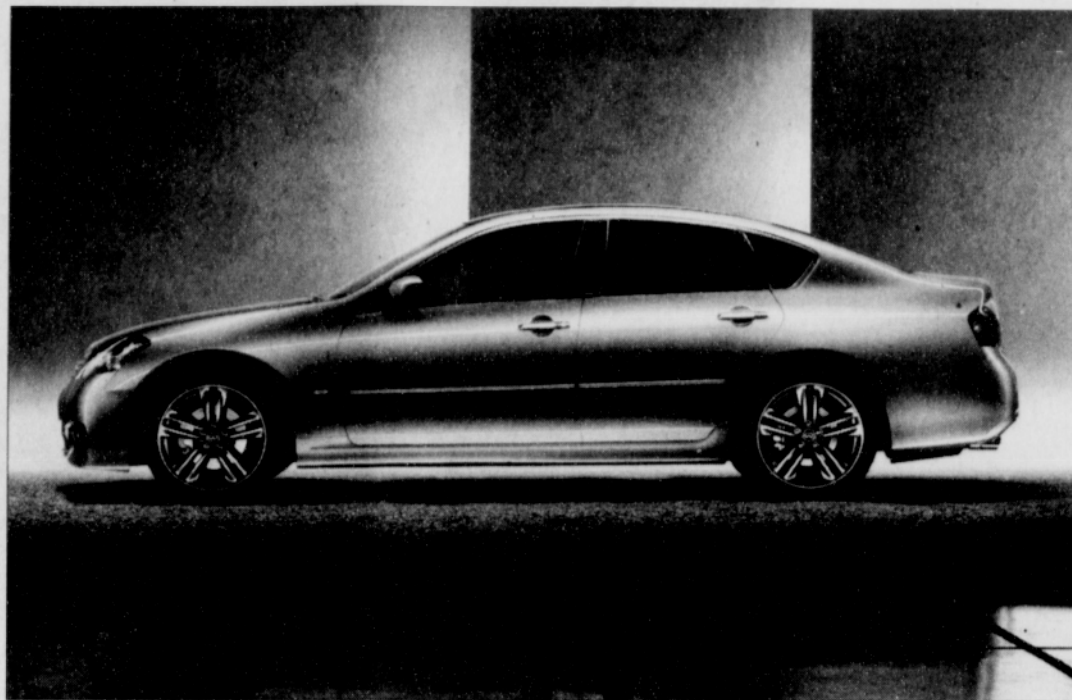
Specifications: 3.5 Liter DOHC 24-valve V6 Engine; Electronically controlled 5-speed automatic with drive sport (DS) mode; 16 city mpg, 22 highway mpg; MSRP $58,415.

The 2009 Infiniti M35 has got an extensive range of standard features such as automatic dual-zone air conditioning with outside temperature display, 10-way power driver's seat, power windows with express up/down, xenon high-intensity discharge headlamps, Infiniti Voice Recognition, temporary spare tire, remote keyless entry, Bluetooth technology, rear active steering,