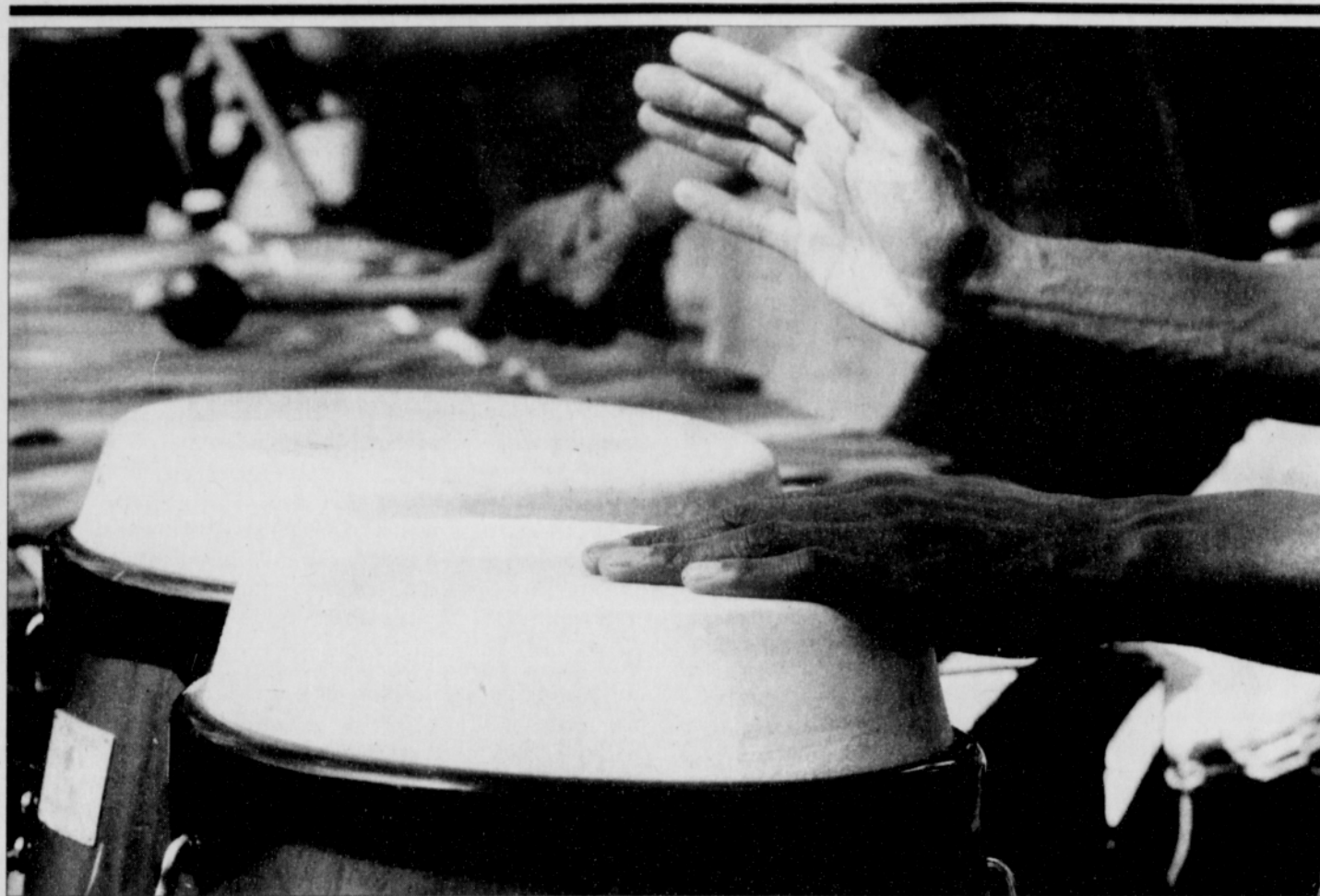
The Zimbabwean "afrocoustic" quartet 'Bongo Love' on their Family of Friends U.S. Tour

CALL 503-288-0033 FAX 503-288-0015 news@portlandobserver.com ads@portlandobserver.com subscription@portlandobserver.com