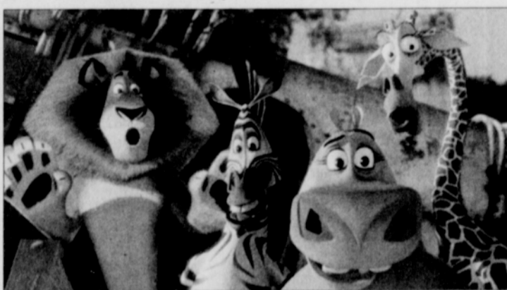
Black Eyed Peas frontman Will.i.am (right) stars as the voice of the romantically-challenged hippo in 'Madagascar: Escape 2 Africa,' a sequel to the 2005 hit now playing in local theaters.

A: "Because today's kids want to be older and today's adults want to be younger. And it's smack right in the middle for both of them."