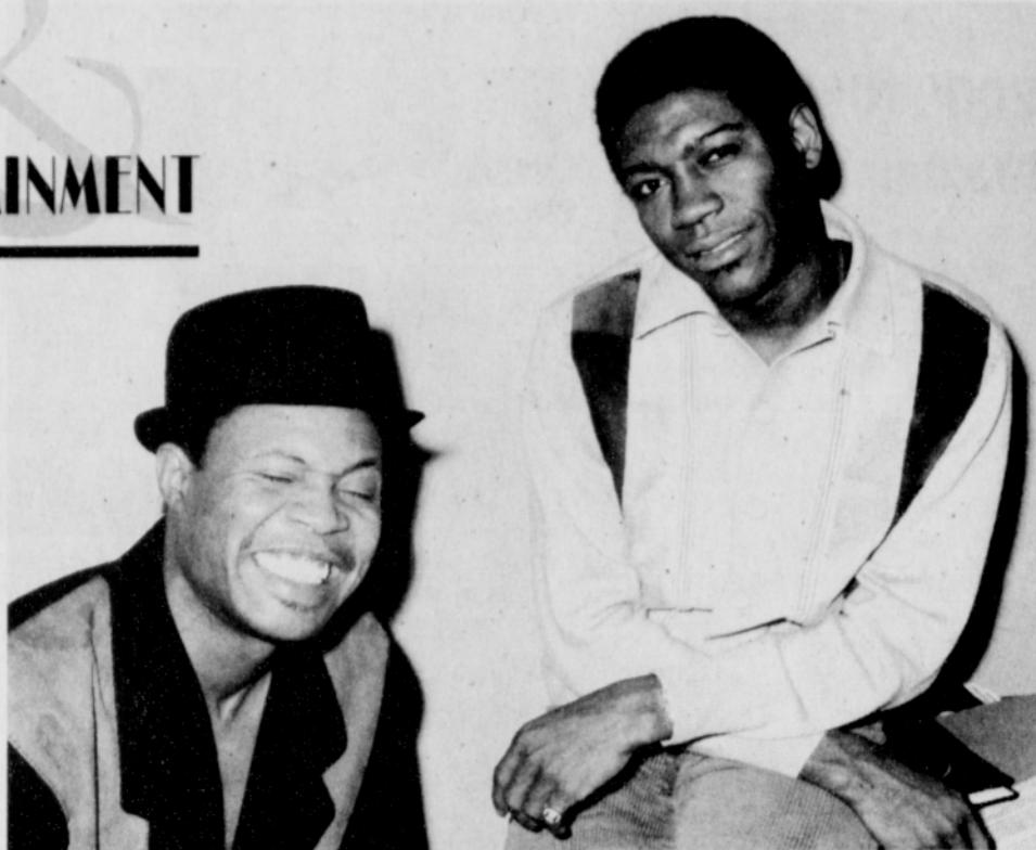
An undated historical photo shows Sam Moore (left) and Dave Prater of the legendary R&B duo Sam & Dave.

In 2006, he released the Grammy nominated "Overnight Sensational" produced