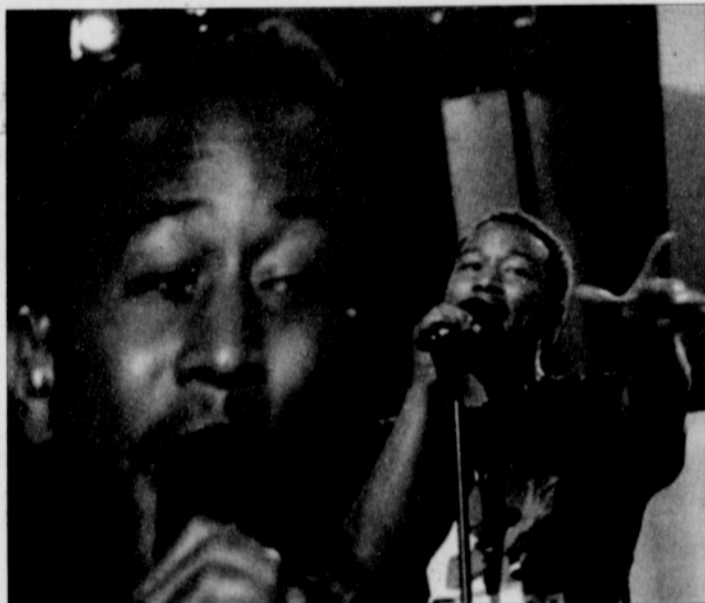
Singer John Legend rehearses last August before the start of the Democratic National Convention in Denver.

it's clear that Legend's first single, "Green Light," which features Andre 3000 of OutKast, isn't in his traditional style. The track boasts a galactic spin with electronic keys and shooting-star sound effects over a quick two-step drum beat.