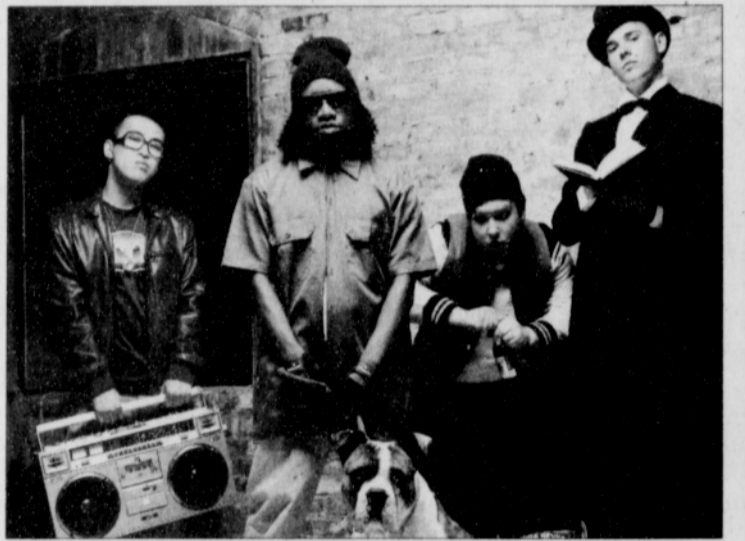
The Buttermilk Baby Makers host a dance party on Halloween, Friday, Oct. 31 at Pala, 105 N.W. Third Ave.

The group will perform their Halloween edition on Friday Oct. 31 at 9 p.m. at Pala, 105 N.W. Third Ave. Admission is $5 before 10 p.m. and $10 after.