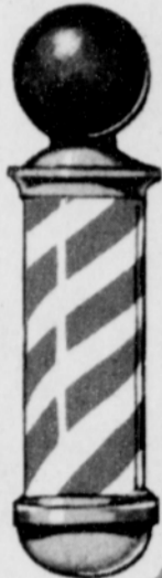
LICENSED BARBER'S WANTED