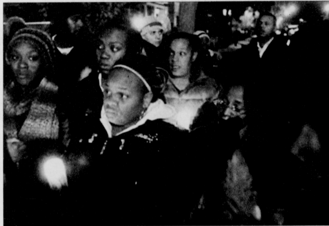
Neighbors on Monday night hold a candlelight vigil for Jennifer Hudson and her family outside the Chicago home where her mother and brother were killed