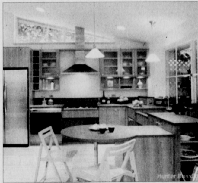
Energy costs are reduced when natural light is added to a kitchen remodel.

The free monthly seminar series will resume on Saturday, Jan. 10, following a holiday break. Full information on the seminar schedule and content is available on the web at neilkelly.com or by calling 503-335-9204.