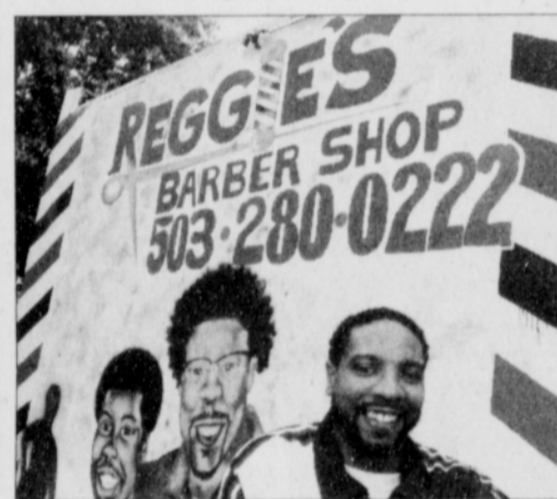
LICENSED BARBER'S WANTED

Ask about our Special - Tightwad Tuesday