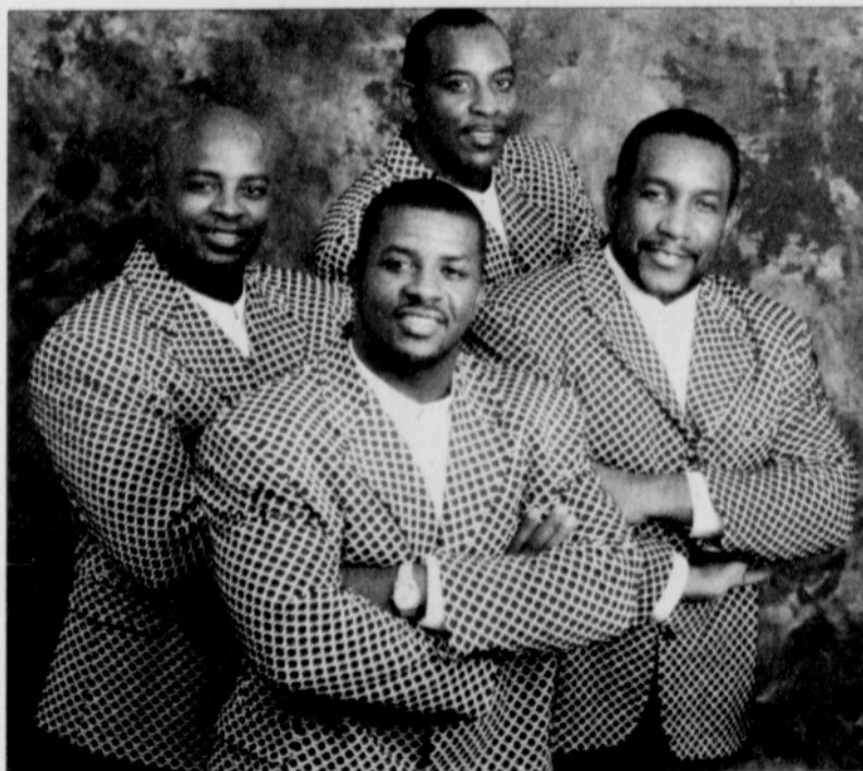
Theme: "I can do all things in Christ... Phil. 4:13"

Celebration will continue at Vancouver Ave First Baptist Church 3138 N Vancouver Avenue, Portland, OR