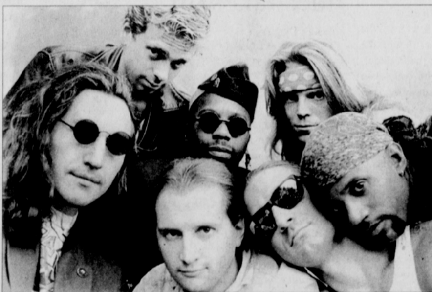
The Crazy 8s are home grown legends of funk, rock and reggae.