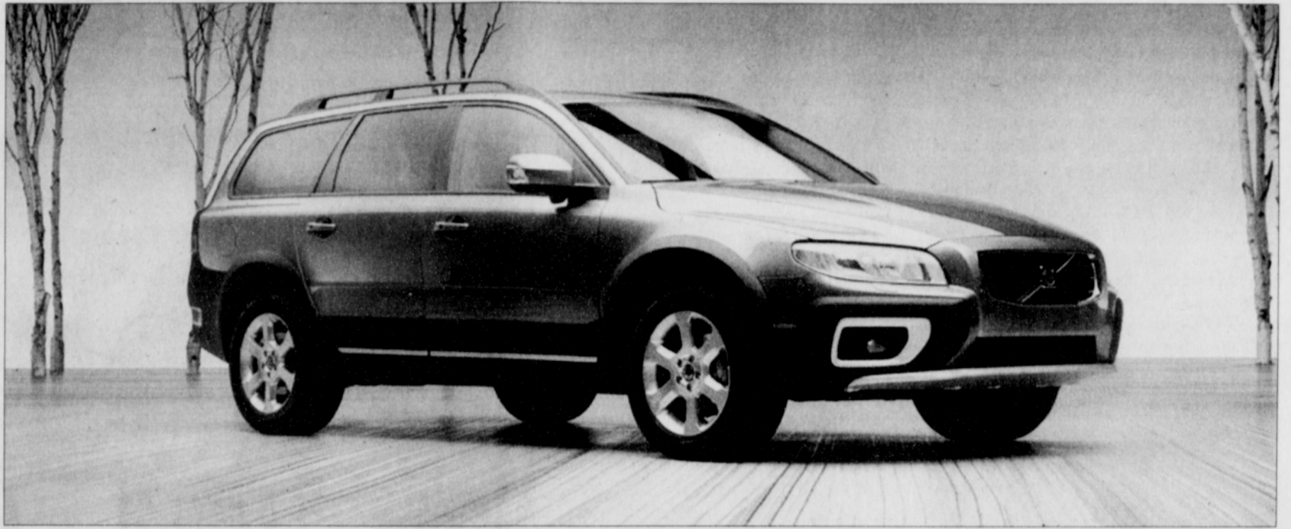
Specifications: 3.0 liter, 6 cylinder Alloy Engine w DOHC; 6 speed automatic transmission; 15 city mpg, 22 highway mpg; $46985 MSRP

The 2009 Volvo XC70 has a smooth and refined ride befit-