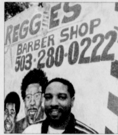
LICENSED BARBER'S WANTED

Ask about our Special - Tightwad Tuesday