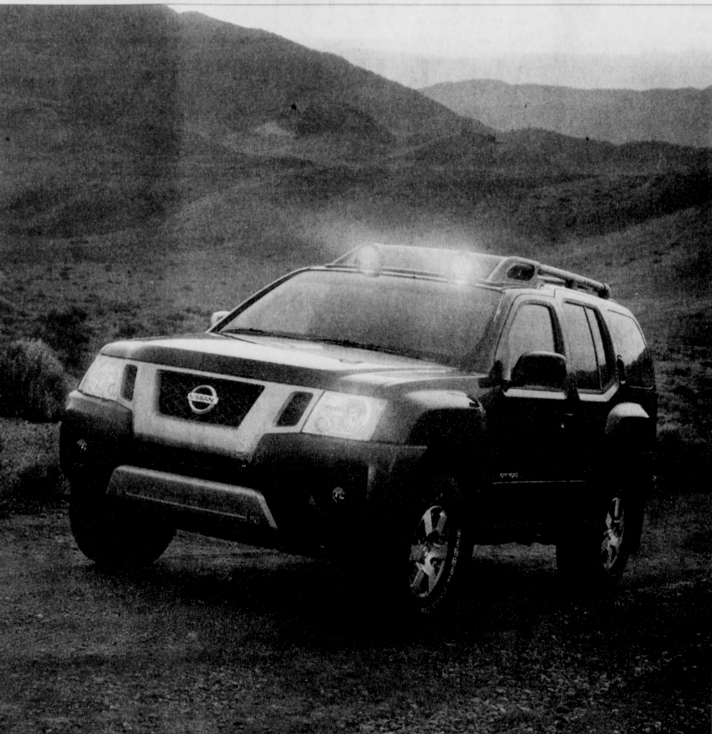
vidual, for everyday use it was a chore to get into. Running Specifications: 4.0 Liter DOHC V6 Engine; 5-speed automatic transmission; 15 city mpg, 20 highway mpg; $30,200 MSRP