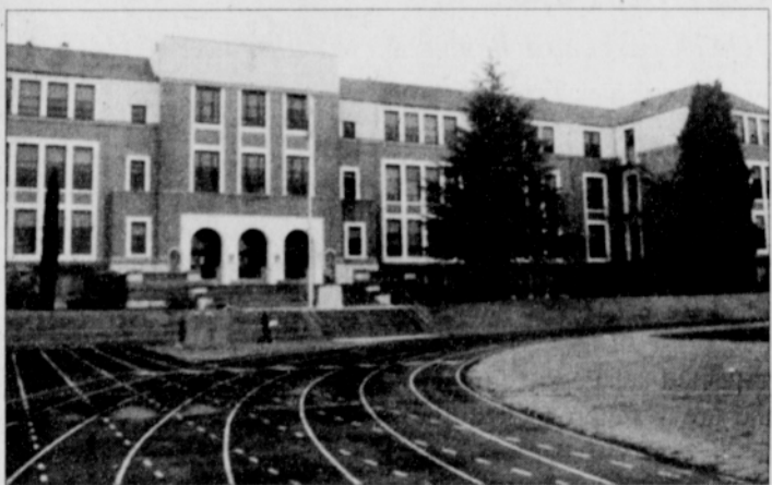
Celebrations are being planned for Jefferson High School 100th year of continuous operation.