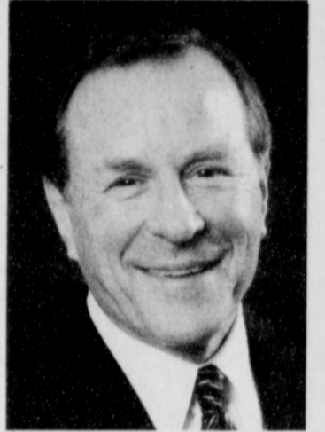
Gov. Ted Kulongoski