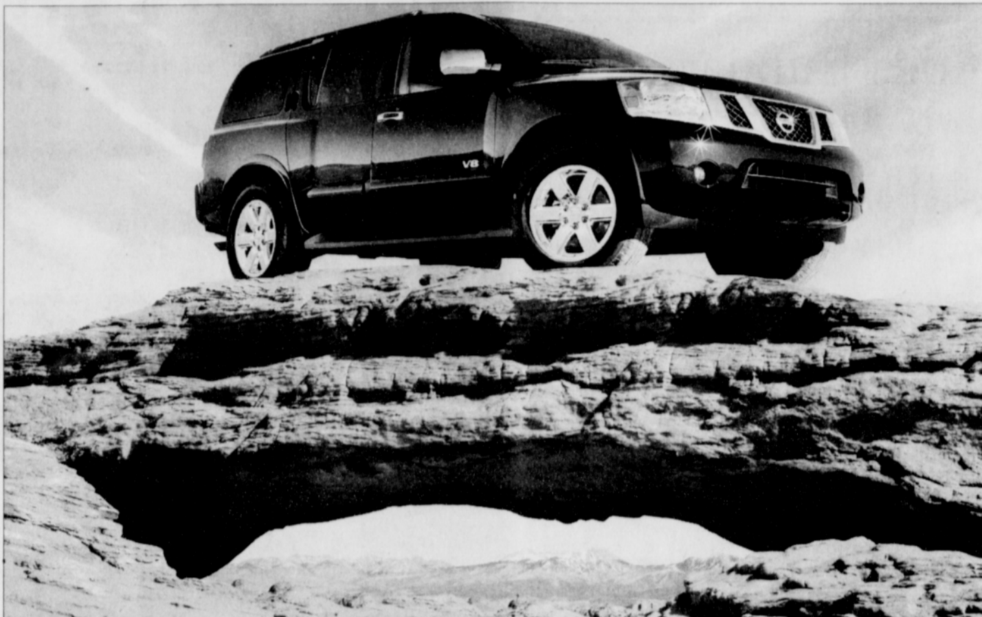
Specifications: 5.6 Liter DOHC V8 Engine; 5-Speed Automatic transmission w/Tow Haul Mode; 12 City, 18 Highway MPG; $50,810.00 MSRP

Nissan uses the same 5.6-liter, V-8 engine in the 2009 Armada that powers the Titan pickup. It is a flex-fuel engine, capable of running on E85. With output of 317 horsepower and 385 lb.-ft. of torque, there is more than sufficient power to motivate the nearly 6,000 lbs. of curb weight that makes up the Armada. Likewise with the five-speed automatic overdrive transmission, which is electronically controlled and has tow and haul modes. The transfer case can be switched from two-wheel