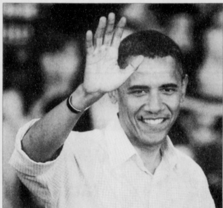
Democratic presidential candidate Sen. Barack Obama, D-Ill., waves after speaking at a campaign stop Monday in Milwaukee, Wisc.

A new USA Today/Gallup poll in the race for President shows Barack Obama with a 50 percent to 43 percent lead among registered voters.