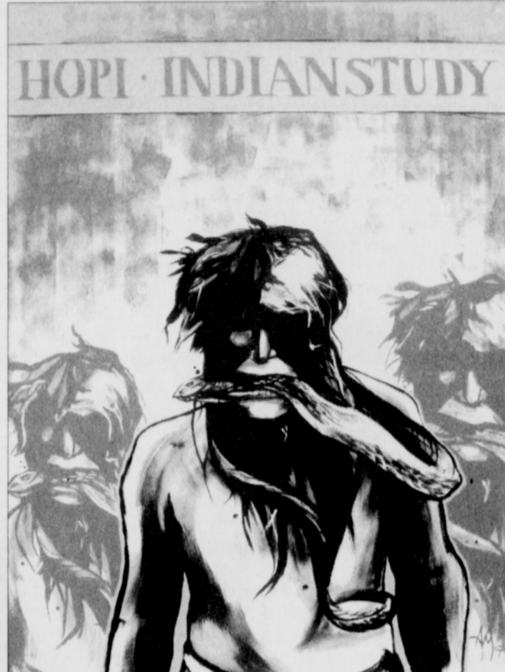
Powerful images and diverse cultural references are found in a painting by Andrew Morrison.

"My artistic creations connect with all tribes, genders, ages, re-