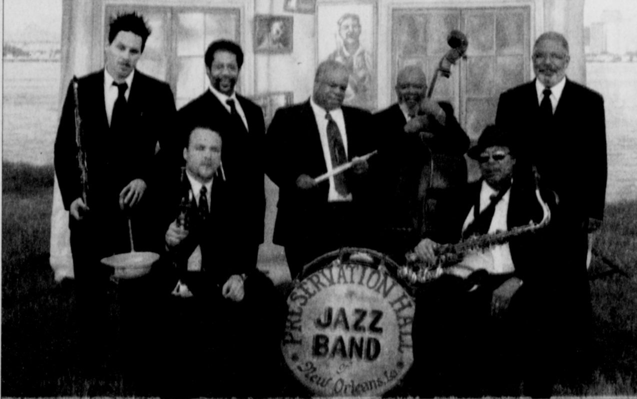
The Preservation Hall Jazz Band, hailing for New Orleans, is one of the headline acts at this weekend's Vancouver Wine and Jazz Festival.