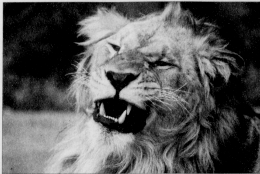
African lions have not been seen at the Oregon Zoo for more than 10 years. That will change when Predators of the Serengeti opens next summer.