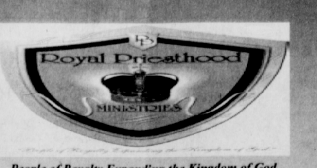
People of Royalty Expanding the Kingdom of God A Ministry that is Kingdom Focused

A Ministry for the family A Ministry with a Fresh & Anointed Message