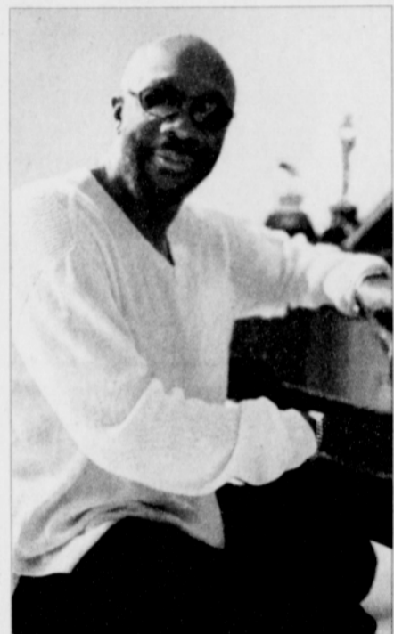
Isaac Hayes will kick off a Tribute to Memphis Soul on Thursday, July 3, the opening day of the Safeway Waterfront Blues Festival. Admission of $10 plus 2 cans of food will benefit the Oregon Food Bank.

The Front Porch will open with Blues from the Edge, featuring semi-acoustic