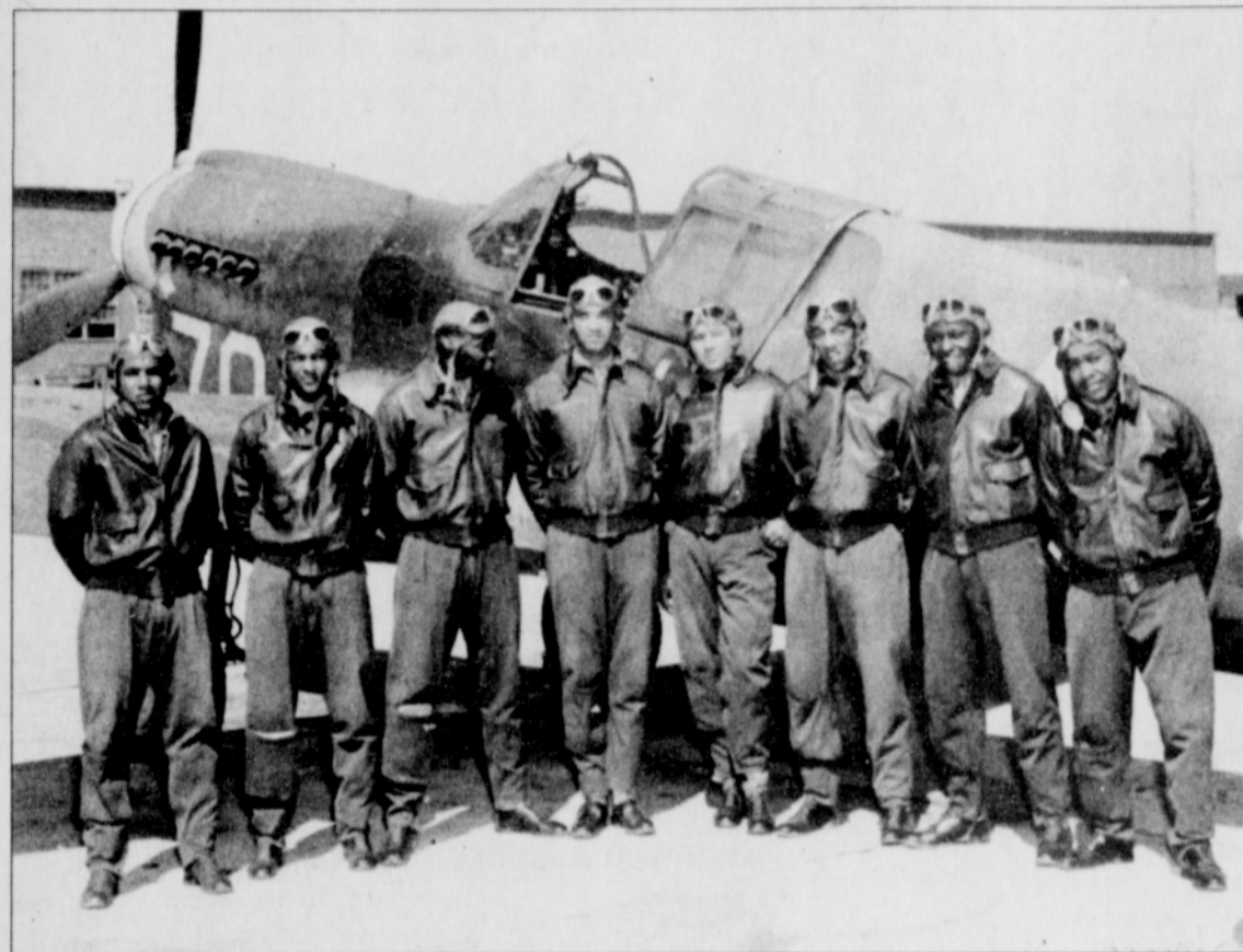
Tuskegee airmen of World War II line up in this historic photo. Director George Lucas plans for a movie based on their historic record.