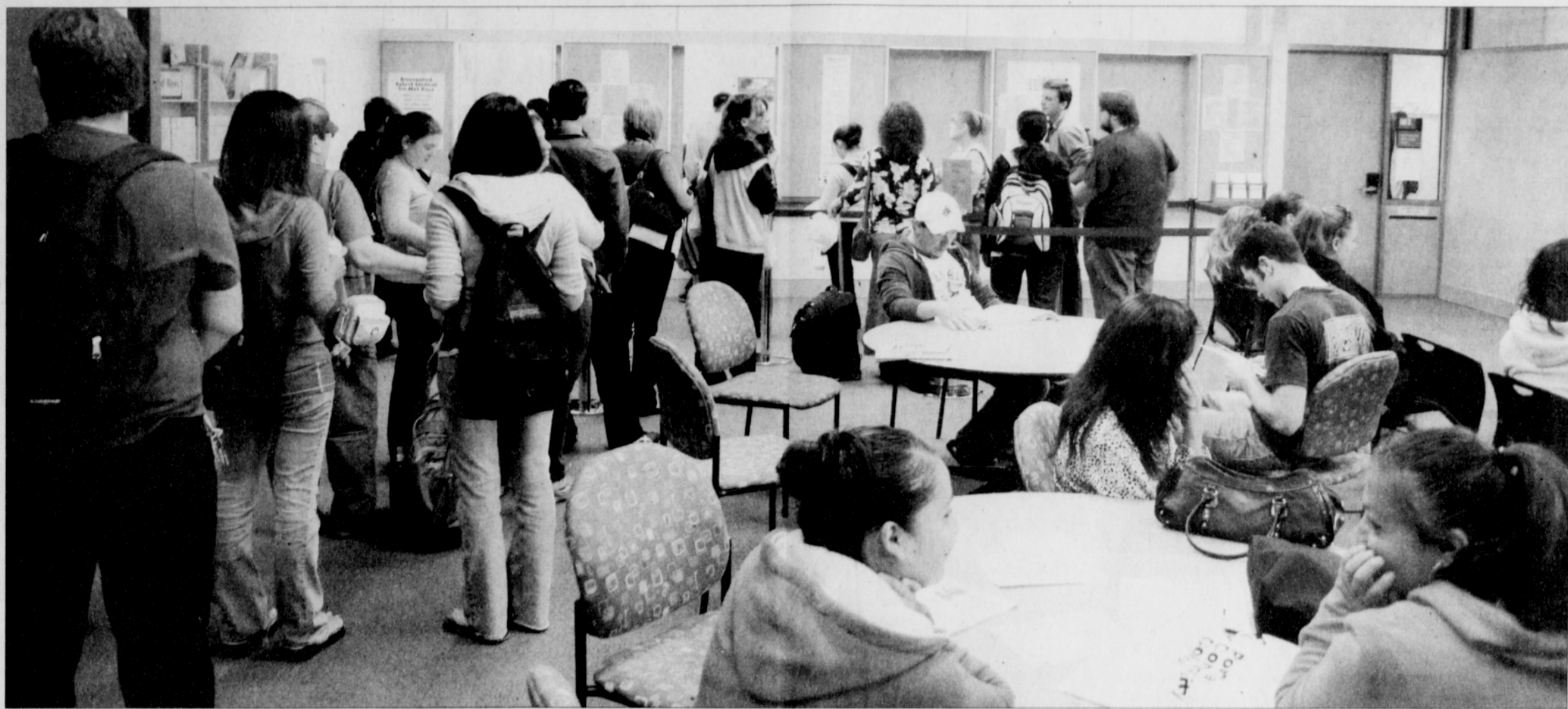
Students jam the Portland Community College registrar's office on the Rock Creek campus in northwest Portland.