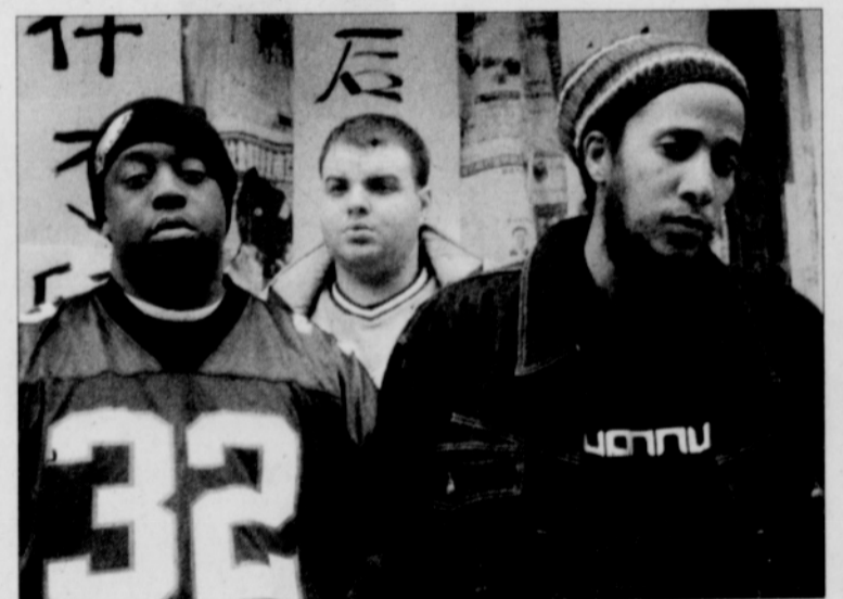
The Portland hip-hop group Lifesavas will perform at Thursday's Roots Festival on the Portland State University Park Blocks.

For more information, visit the Roots Festival's website at rootsfestival.groups.pdx.edu/index.php.