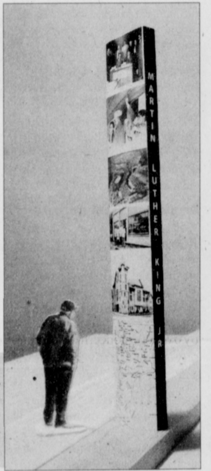
A panel of historical images is one of the conceptions for a Portland Development Commission "Gateway" marker into northeast Portland neighborhoods.