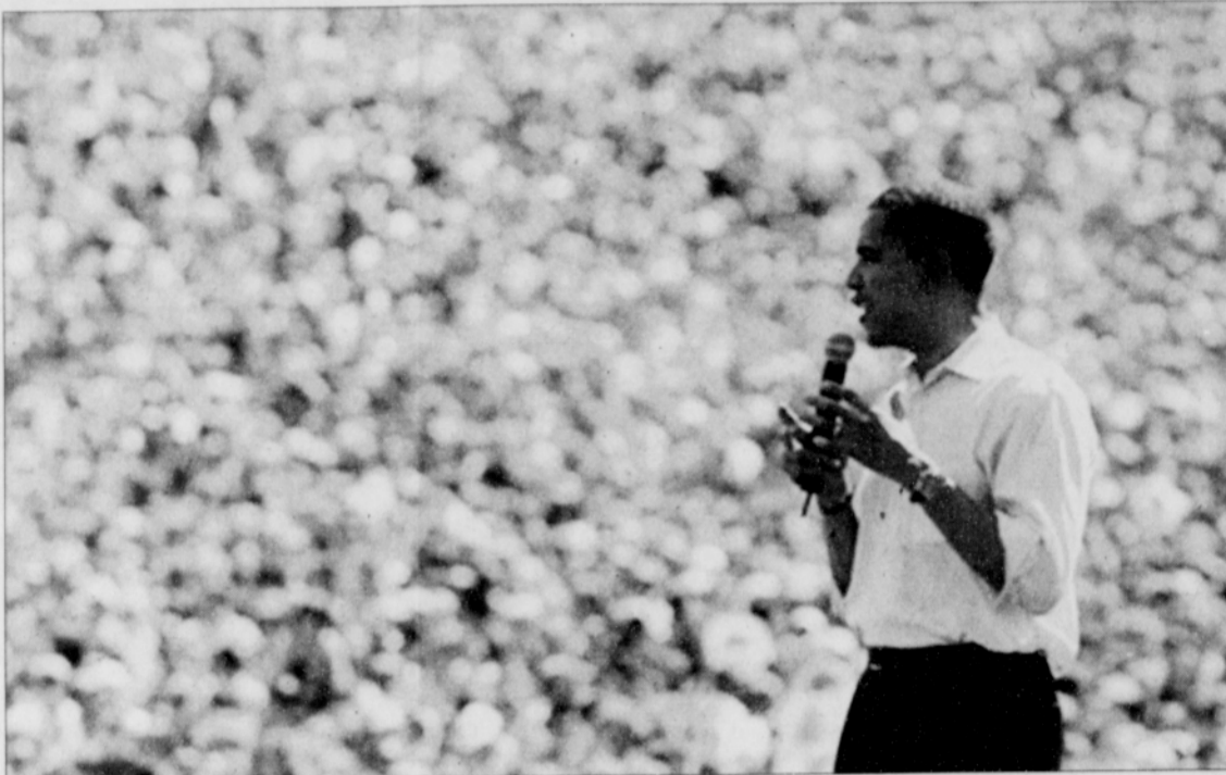
Portland Waterfront Rally - Sen. Barack Obama generated the largest political crowd in Oregon history Sunday when 75,000 people packed the downtown waterfront on a sun-drenched afternoon to hear the Democratic presidential candidate speak. It was also the biggest crowd by any candidate in the presidential primaries this year.

Michelle Obama later clarified the remark, saying she meant she was proud of how Americans were engaging in