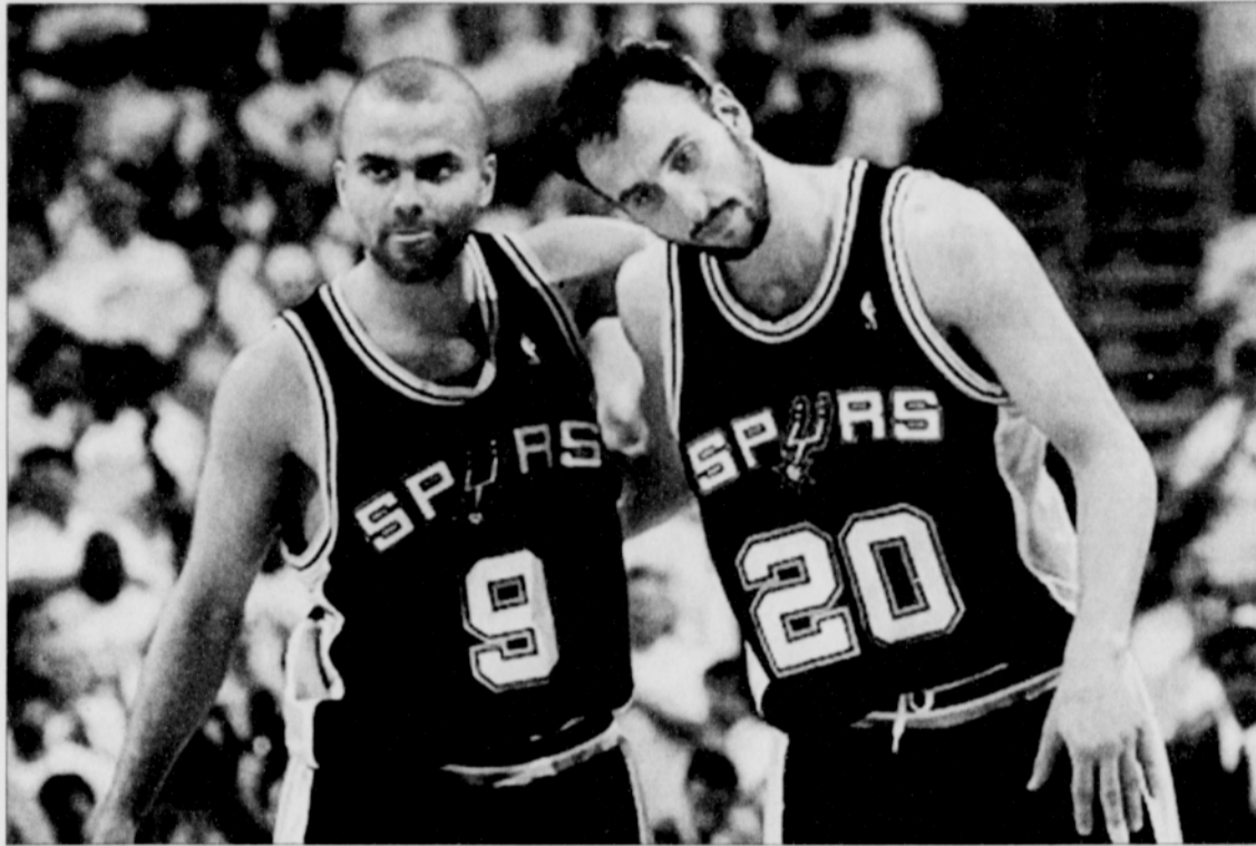
Tony Parker (left) and Manu Ginobili of the San Antonio Spurs celebrate Monday after defeating the New Orleans Hornets 91-82 to advance to the Western Conference Finals.

The Hornets had dominated the third quarters of their three previous home games in this series. This time, the Spurs, who have won four titles in the previous nine seasons, had an answer. It was their calling card: stingy defense.