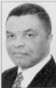
BY ALGIE GATEWOOD

It's no secret – we are living in hard economic times. Unemployment is on the rise, economic growth has all but ground to a halt. Even in Portland, housing prices – for so long a major repository of American wealth – are losing value. And the long departure of good blue-collar jobs to foreign shores continues.