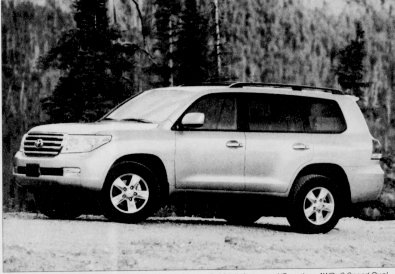
tegrated comfort and conve- light up, needles bounce once, Specifications: 5.7-Liter 32-Valve Dual VVT-i cam 381-hp @ 401 lb-ft. torque V8 engine; 4WD; 6-Speed Dual O/D w/sequential shift mode automatic transmission; 13-City 18-Highway MPG; $71,385. MSRP

Throttle response is improved dra full-size pickup. Toyota has into look dated or go out of style. The timing technology, cam lobe de- two overdrive gears at the top, in-