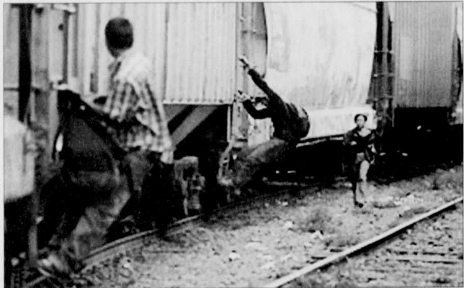
Mexico has its own illegal immigrant population and, until recently, dealt with them using very harsh penalties.

Immigrants here, mostly Central Americans trying to reach the U.S., are often