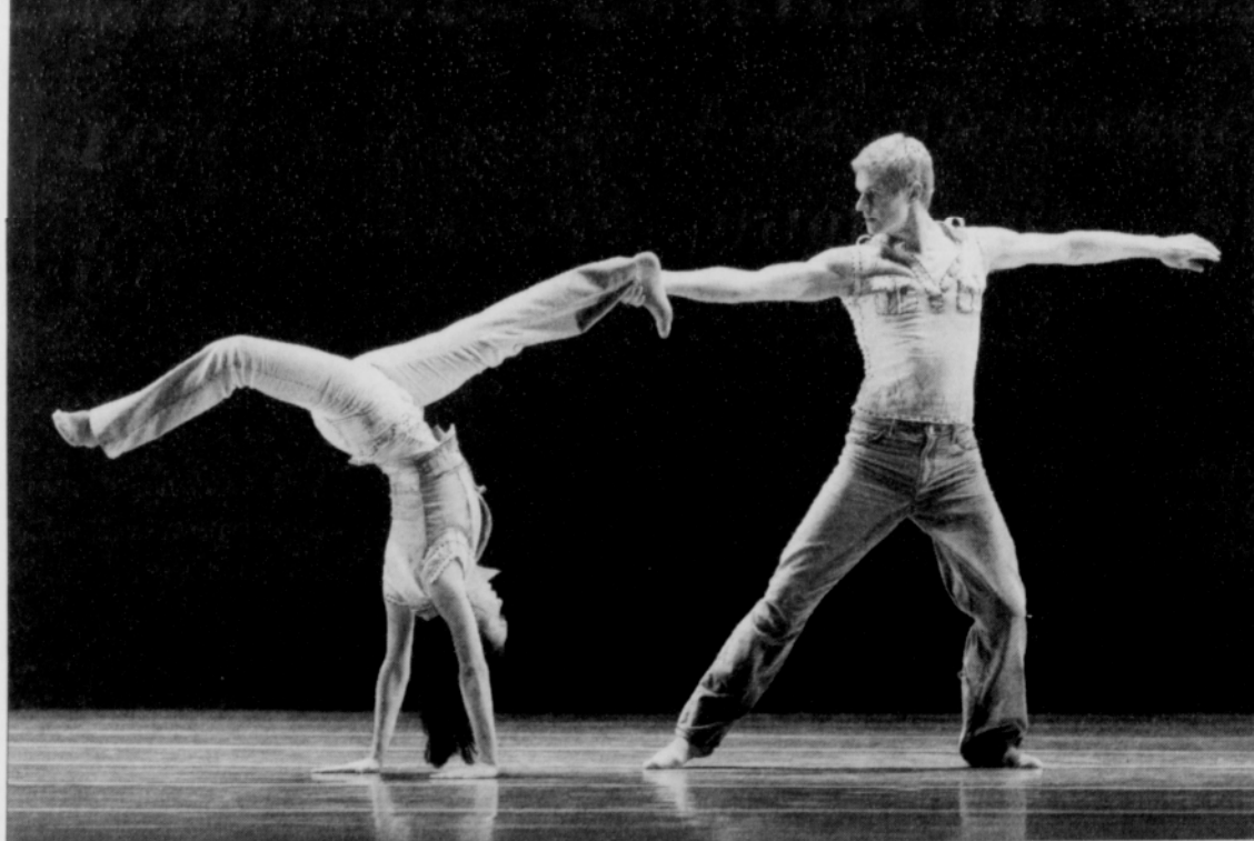
Dancers from the Pacific Northwest Ballet will be among four contemporary dance companies to appear together in Portland, May 8 and 9 at the Arlene Schnitzer Concert Hall.

White Bird presents its landmark "4x4 The Ballet Project," featuring the West Coast four major ballet companies appearing together for the first time at 7:30 p.m. on Thursday, May 8 and again on Friday, May 9 at the Arlene Schnitzer Concert Hall.