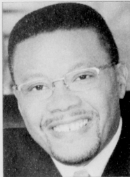
Judge Greg Mathis

Tickets to the dinner are $100, but those who cannot afford the price will not be turned away. For more information, call Cornerstone at 503-281-4587.