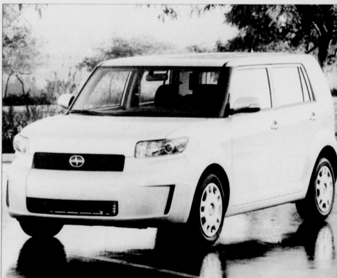
Specifications: 2.4-Liter, 18-valve, 158-hp @ 162 lb-ft. torque, 4-cylinder engine; 4-speed sequential automatic transmission; 22-City 28-Highway MPG; $23,377. MSRP

The interior feels as changed as the exterior looks. There are no gauges directly in front of the driver, which is a bit weird; but the row of four of them on the dashboard just to the right of the steering wheel makes up for it, because they're good. The digital speedometer is excellent, with big numbers that are, like the clock, eminently read-