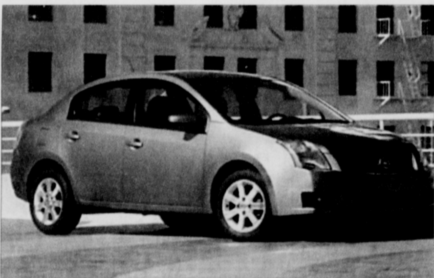
Specifications: 2.0-Liter, 140-hp@147 lb-ft. torque, DOHC, 4-cylinder engine; 2-speed Xtronic CVT transmission with overdrive; 25-City 33-Highway MPG; $16,930 MSRP

The bottom line is that the 2008 Nissan Sentra 2.0 is a family-friendly comfortable cruiser; providing a budget-conscious respect for buyers. Making the 2008 Nissan Sentra 2.0, a real family value.