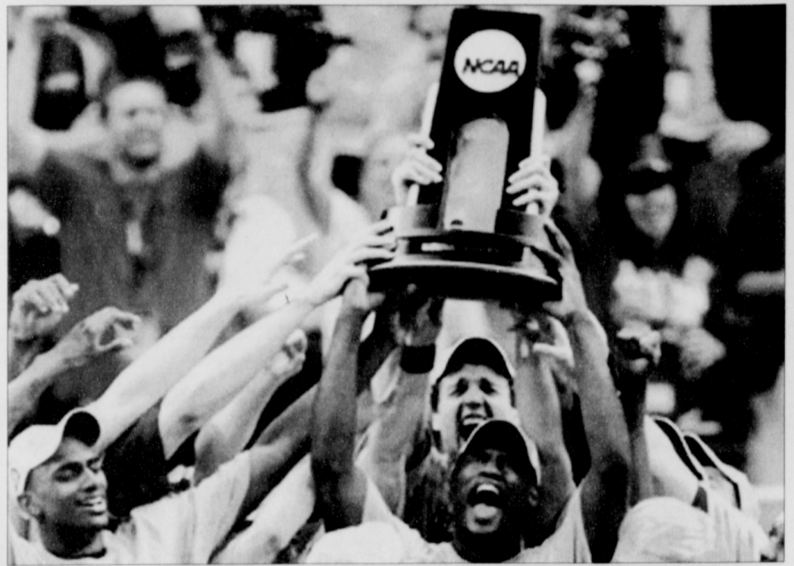
Kansas Jayhawks celebrate with their trophy after defeating the Memphis Tigers Monday for the NCAA Men's Championship.