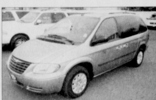
Stock No: 21359