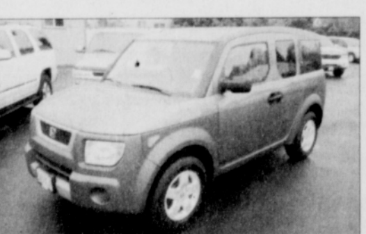
Stock No: 21222

2 Door Convertible Mileage: 40,995 4.6-liter, V8, SOHC, 16-Valve, Auto, RWD