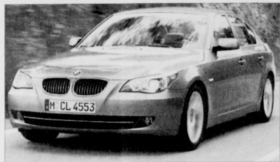
Specifications: 3.0-liter, DOHC, 24-valve Inline-V6 230-hp@200 lb-ft. torque engine; 6-speed manual transmission; 17-City, 27-Highway MPG; $55,525. MSRP

this class. BMW says 0-60 mph near-perfect size. It seems more dations in fairly compact package. Go system works even in heavy sedan, including the features, com-