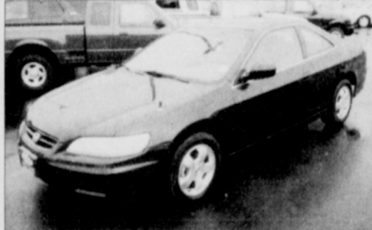
Stock No: 21214