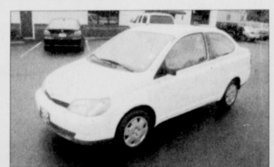
Stock No: 21186

Mileage: 73,901 2 Door Coupe 2.3-Liter, 16-Valve, VTEC, 4-Speed Auto, FWD