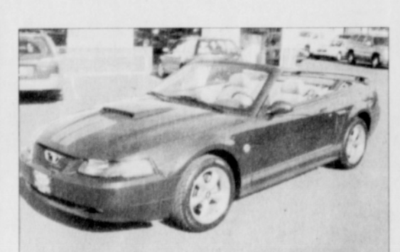
Stock No: 21286

2003 Toyota Camry LE 4 Door Sedan 2.4-Liter, DOHC, Auto, FWD