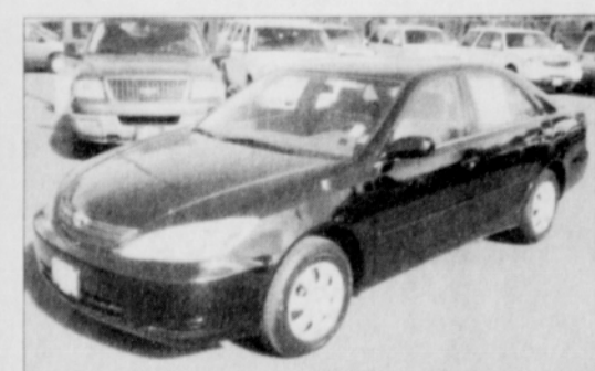
Stock No: 21232

Mileage: 86,507 4 Door Van 3.5-Liter, V6, 5-Speed Auto, FWD