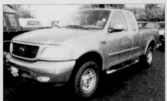
Stock No: 20751