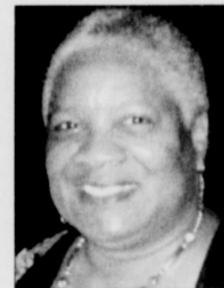
Avel Gordly State Senator