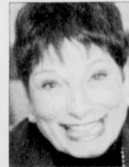
Vera Katz former Mayor of Portland