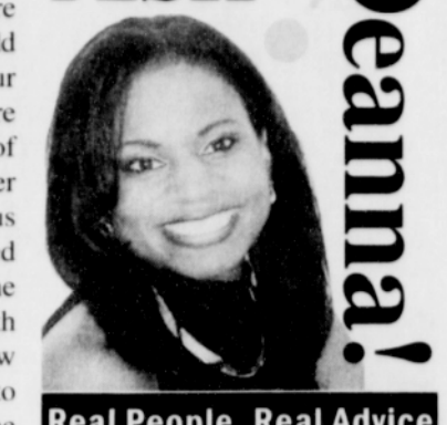
Real People, Real Advice An advice column known for its fearless approach to reality based subjects!

You obviously have trust issues if you can't feel secure with your mate or your friends. Your foolish tongue has caused you to lose your relationship and your friend. with your buddy, then you learned www.askdeanna.com