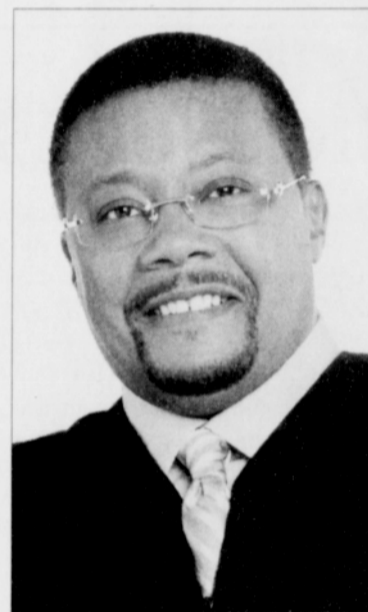
Judge Greg Mathis