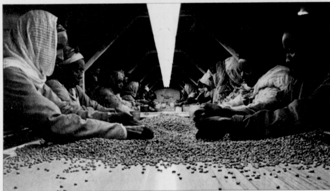
Ethiopian coffee packers work under harsh conditions in the documentary "Black Gold" coming Monday, March 3 to the Multicultural Film Festival at Jefferson High School.

In Ethiopia, for example, 15 million people are dependent on the coffee industry; 67 percent of its foreign trade is in coffee. Between