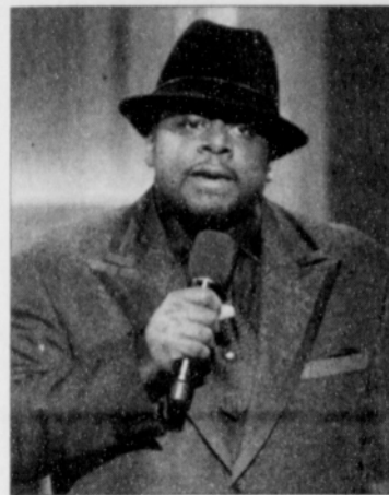
Cedric 'The Entertainer'

Hosted by Cedric "The Entertainer," the celebration pays