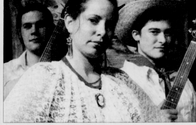
Cuentos - Searching for My Story

Searching for My Story -- Weaving traditional music, dance and story, "Cuentos - Searching for My Story," is a bilingual, family-friendly production encouraging audiences to value their