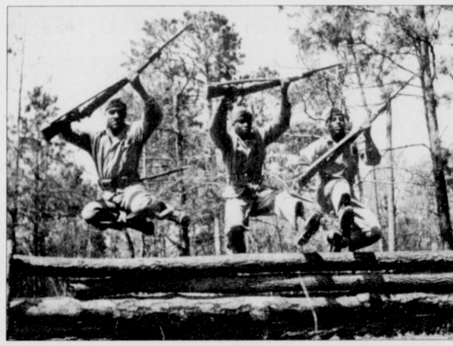
All-black battalions who served their country in three wars - while fighting for civil rights back home - are profiled in the PBS special "Marines from Montford Point: Fighting for Freedom."