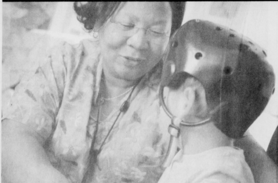
Legacy Emanuel Hospital is a major employer in Northeast Portland and a cornerstone for community health and healing.

We believe that everyone should enjoy the best healthcare available.