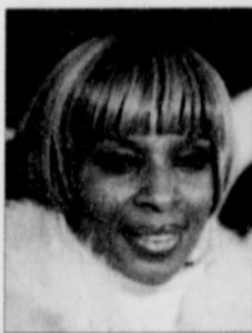
Mary J. Blige