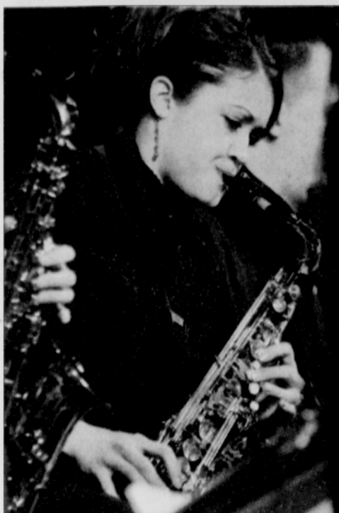
Clark College will host its 46th-annual Jazz Festival Thursday through Saturday

Preliminary competitions take place on Thursday from 10 a.m. to 5 p.m. and on Friday and Saturday from 8 a.m. to 5 p.m., with final competitions each evening at 7 p.m. Admission is $5 per day.