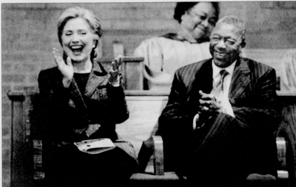
Democratic presidential hopeful, Sen. Hillary Rodham Clinton, D-N.Y., laughs with Bob Johnson (right), president of Black Entertainment Television during services Sunday at the Northminster Presbyterian Church in Columbia, S.C.

Clinton's campaign issued a statement in the same vein about an hour after Obama spoke, saying it was time to seek common ground. "And in that spirit, let's come together, because I want more than anything else to ensure that our family stays together on the front lines of the struggle to expand rights