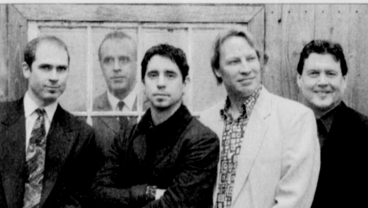
3 Leg Torso