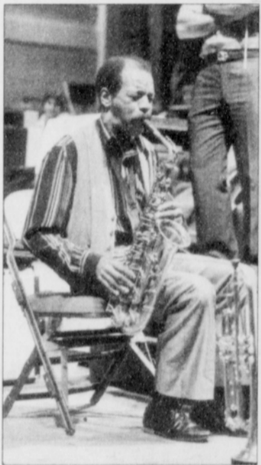
Jazz saxophonist Ornette Coleman is examined in 'Ornette: Made in America,' one of the featured screenings of the NW Film Center's Reel Music festival.

The films are showing through Feb. 3 at the Whitsell Auditorium, 1219 S.W. Park Ave. Admission prices are $7 for adults, $6 for students and seniors and $4 for Friends of the Film Center. Double features are an additional $2 per ticket.