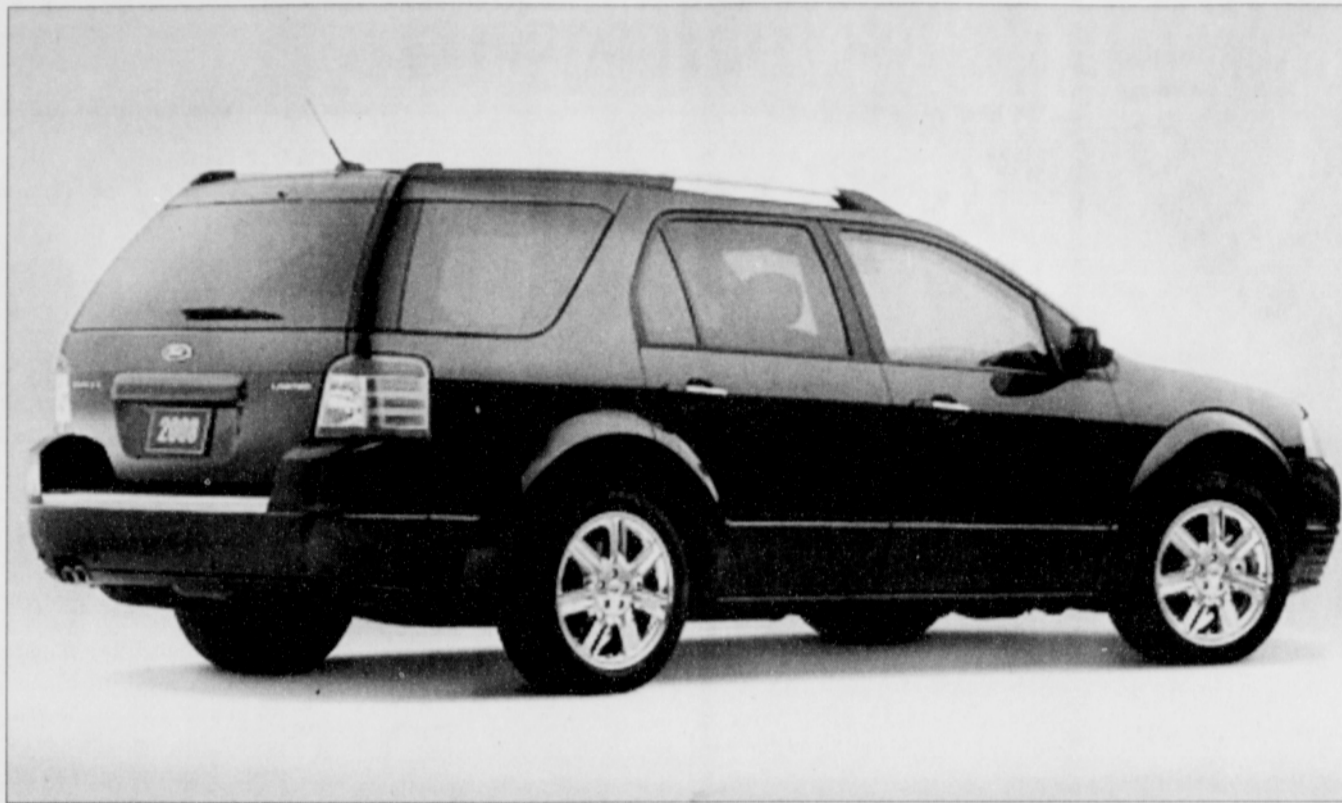
Specifications: 3.5-Liter, 263-hp @ 249 lb-ft. torque V-6 engine; 6-Speed automatic transmission, 17-City 24-Highway mpg; $38,160. MSRP

Taurus X's all-wheel-drive system, now similar to that of the Ford Edge, is new for 2008. It is less complex than the system it replaces, and it uses on-demand electro-mechanical center coupling to allocate a precise amount of torque from front to rear, up to 100 percent to either axle.