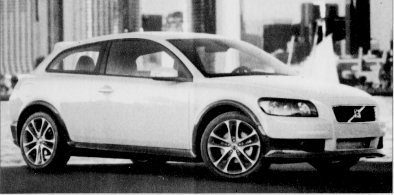
SPECIFICATIONS: 2.5-Liter, 5-Cylinder 227-hp @ 236 lb-ft. torque Turbocharged Engine; 6-Speed Manual transmission; 19-City 28-Highway MPG; $27,950. MSRP

As an added safeguard, the nose has a small, soft plastic beam in front of the