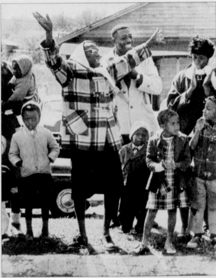
Jubilant local residents greet the procession from the Selma march along Highway 80.