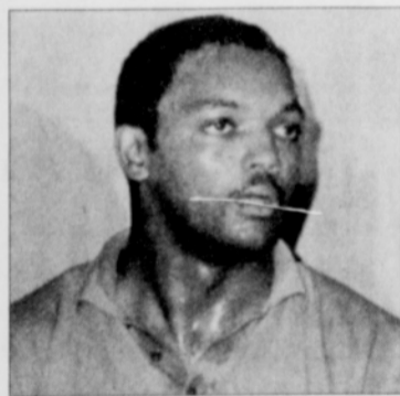
Seminary Student Jesse Jackson leads marches against segregated Chicago housing and schools in the summer of 1966.